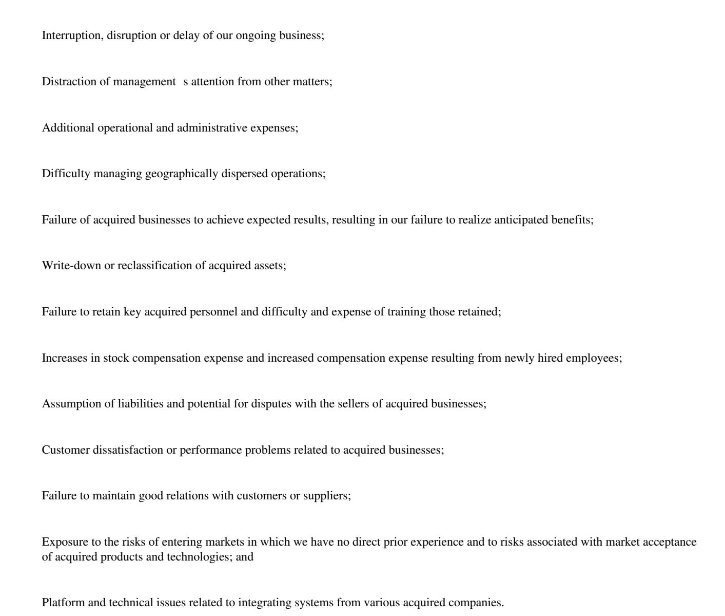
Table of Contents 80

From 1993 to 1999, we completed 28 acquisitions, and we encountered significant challenges integrating the acquired businesses into our operations. From 2000 through 2003, we made significant progress toward that integration. However, we continue to support several different technology platforms. In February 2004, we acquired Détente Systems Pty Limited, an Australian proprietary limited company, and Détente Systems Trust, an Australian business trust. In the future, we plan to make investments in or acquire additional complementary businesses, products, services or technologies. These investments and acquisitions will create new integration challenges. Some of the challenges we have encountered, and may encounter with acquisitions in the future, in integrating acquired businesses have included: